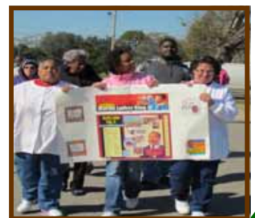
TARC clients and staff participate in the annual MLK March.