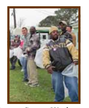
Houma Grown Workers are ready for the riders