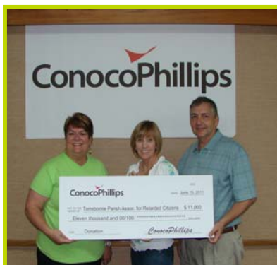
TARC received an $11,000 grant through ConocoPhillips. Thank you!