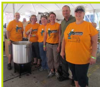
TARC participated at the TFAE 5K Run for Excellence by serving chicken and sausage gumbo.