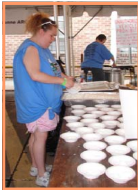
TARC served Chicken and Sausage Gumbo.